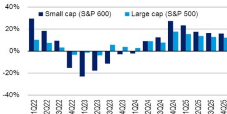
Exhibit 1: Quarterly y/y bottom up EPS growth trajectory for S&P 600 vs S&P 500 (Consensus estimates 4Q23 onward; based on historical index constituents)

Note: Based on historical Index constituents, e.g. bottom-up EPS of constituents as of each quarter compared to bottom-up EPS in the year-ago quarter of the year-ago constituents.