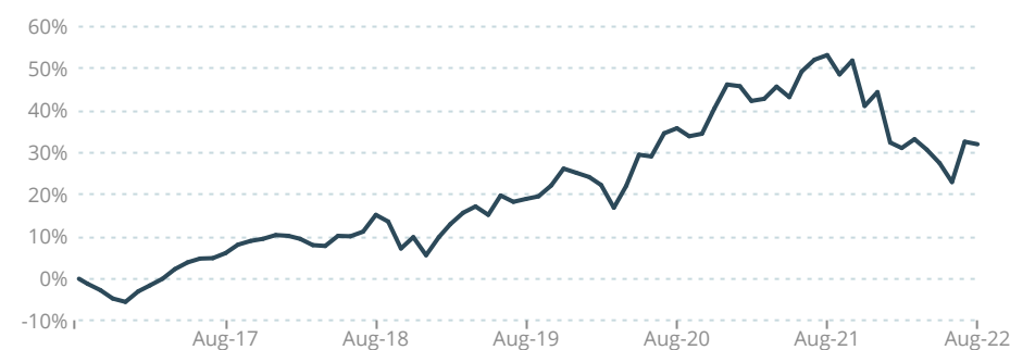
■ Heptagon Future Trends Hedged Fund